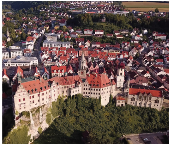
University location Sigmaringen, Castle

Staatliche Hochschule für Musik www.hfm-trossingen.de